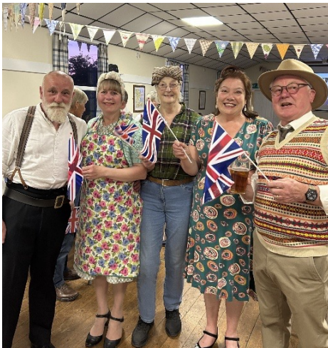
Entering into the spirit of the 1940s

This month (August 8 th ), we have a BBQ. Please come along to sample traditional BBQ food as well as the usual drinks!