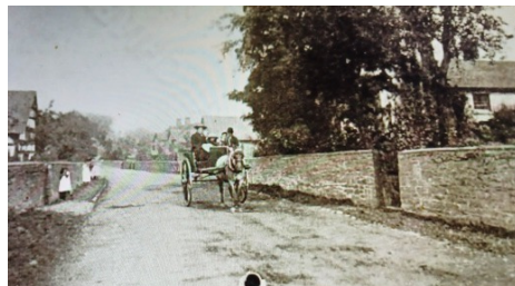
Pitchford in the 1920s

Next year, the Hall will be 100 years old (although as a 1920's prefab, re-erected on its current site, the building itself will be much older!). The Hall itself was opened on the 15 th December 1926 by Lady Sybil Grant from Pitchford Hall, and we have a number of ideas to celebrate this in 2026, details of which will emerge on the usual communication channels!