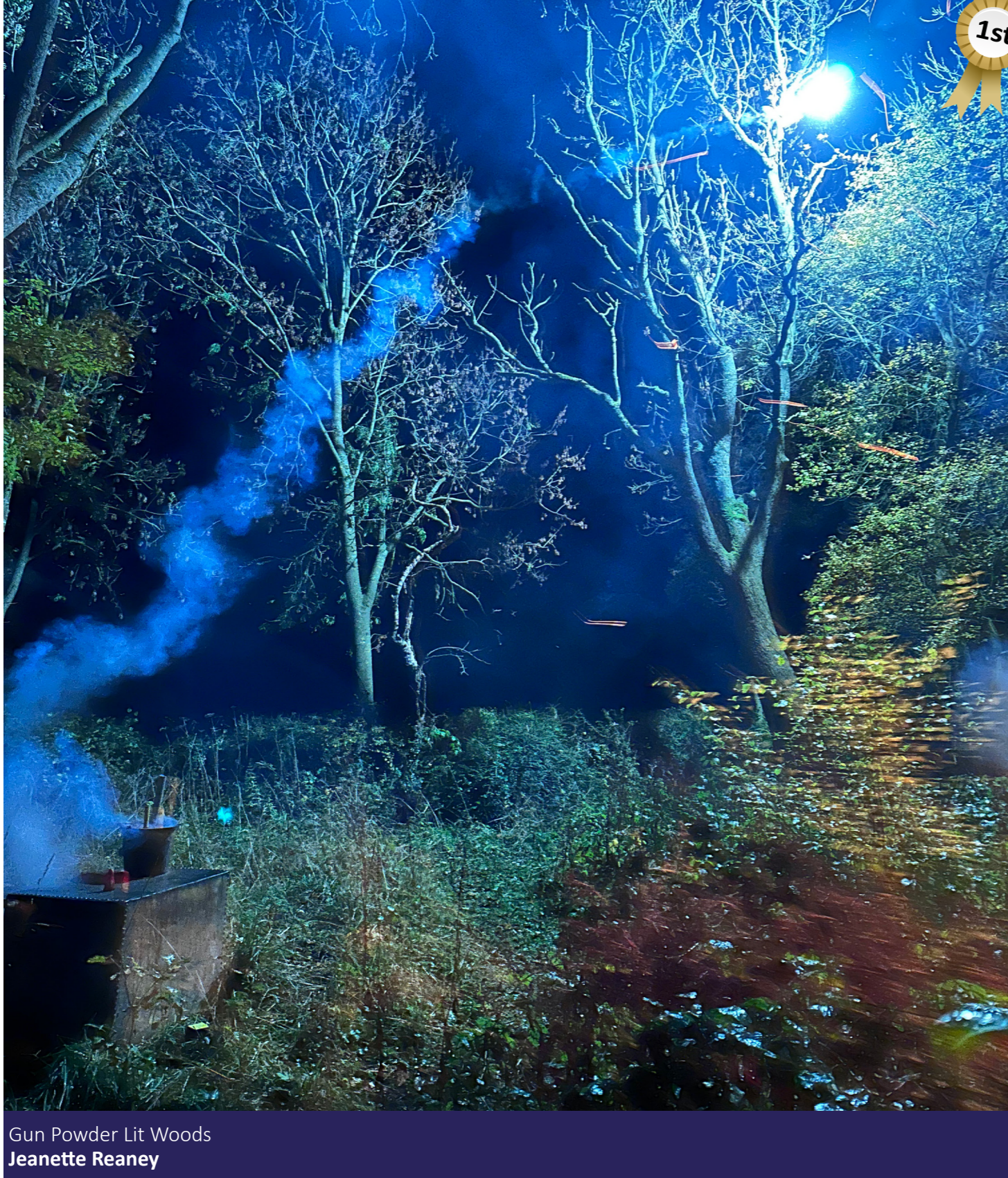
Gun Powder Lit Woods Jeanette Reaney

The Autumn round of the PVH Photography Challenge gave us 15 spectacular entries from around the local area, stretching from HQ in Pitchford and including Leebotwood, Ryton, Acton Burnell, Dorrington, Frodesley, Lawley and Cressage. As before the photos captured the variety and beauty of our local surroundings, covering landscapes and skyscapes, sunsets and sunrises, woodlands and uplands.