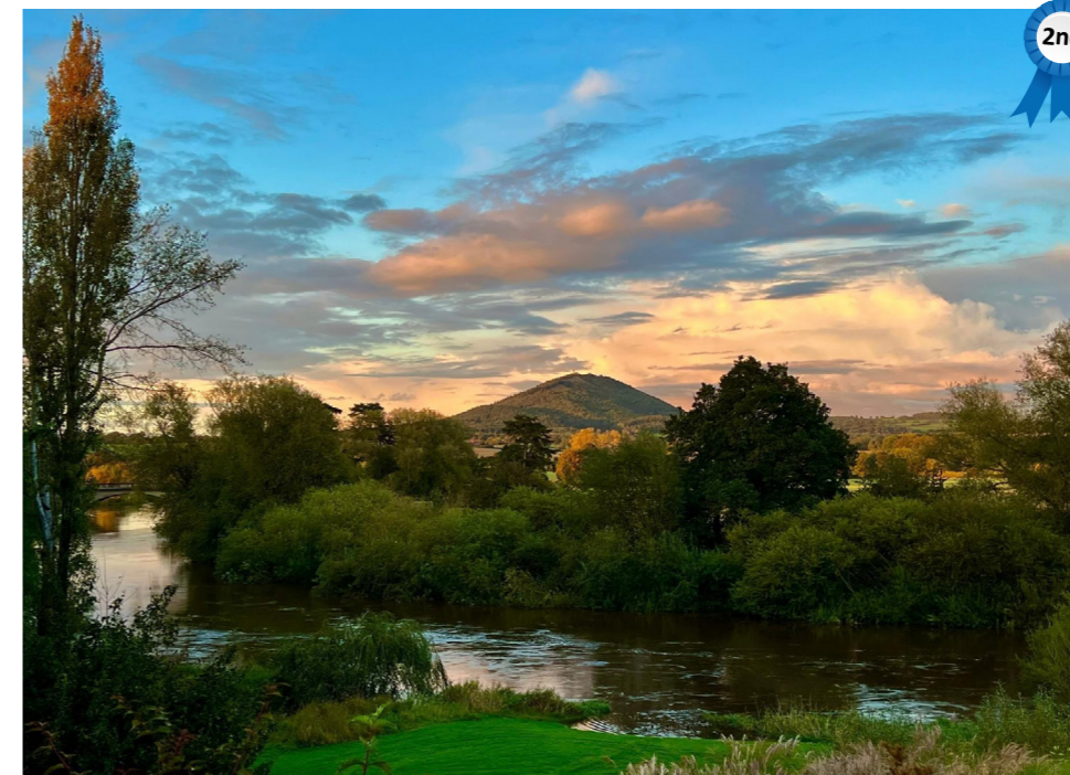
Wrekin from Cressage