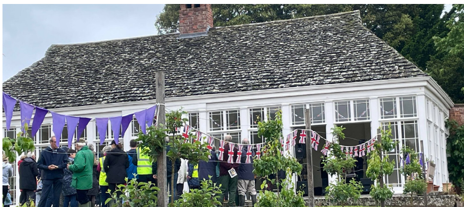
View of the Orangery