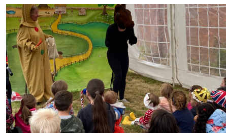
Watching the Gingerbread Man