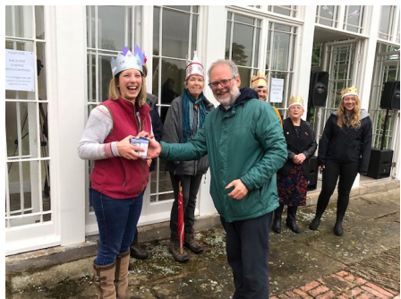
Adult Crown Winner