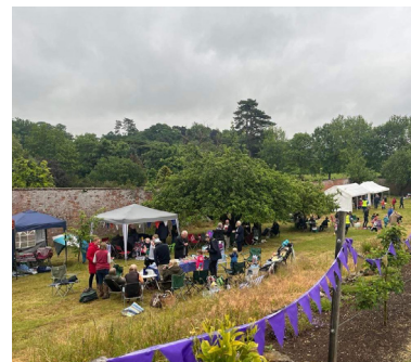
View of the Picnic