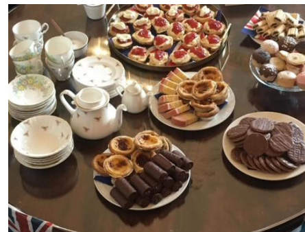
Afternoon Tea at Concord College